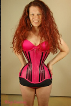
Bespoke (Made to Measure) Corsetry

Corset Styles | Corset Info | Purchase | Consultations | Contact Amy | Studio Cam | Updates | Home